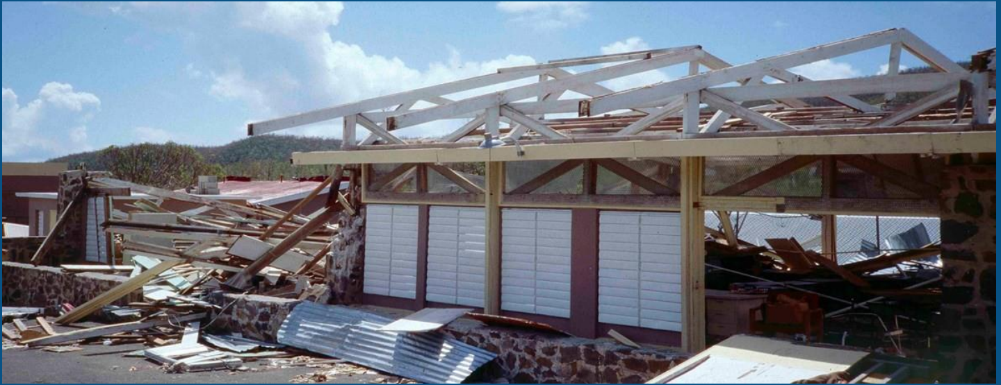
Figure 4. Two classrooms at the far end of the six-classroom building completely destroyed.