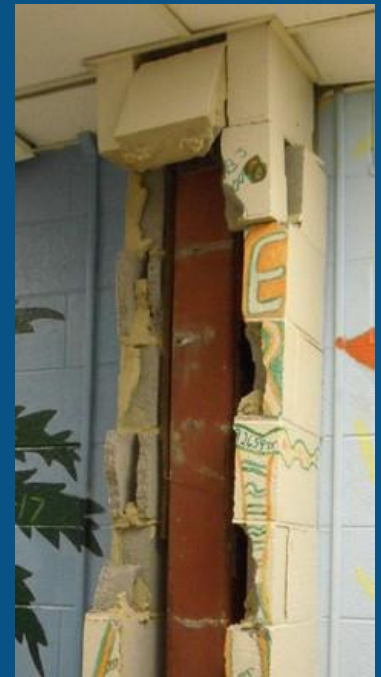
Figure 3. Damaged CMU removed, revealing undamaged steel tube column.