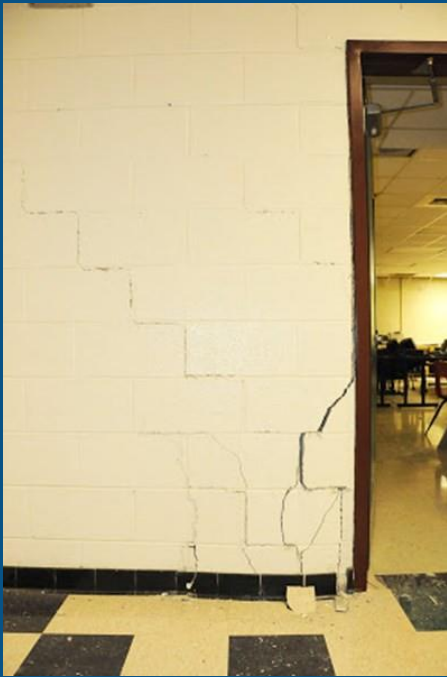
Figure 1. Stepped cracking in masonry wall with buckling and out-of-plane spalling of CMU shell at toe of wall segment.

and contents damage does not count toward SSD but can be helpful in understanding the mechanism of the structural damage. Falling hazards, or the safety of the building in its damaged state, do not affect SSD. Finally, whether the structure was properly designed, and whether the damage was surprising or predictable, do not affect SSD.